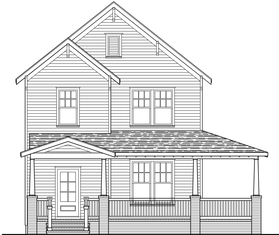
2199 Plan Elevation DW